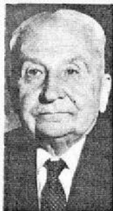
Ludwig von Mises

Also, a half-a-dozen special Awards of Appreciation are given out to speakers, supporters and workers at the FOF Conference.